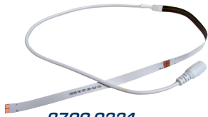
8700-0221 Power Feed