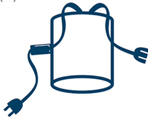
10' power cord with rollswitch & male plug, 30" power cord with female connector