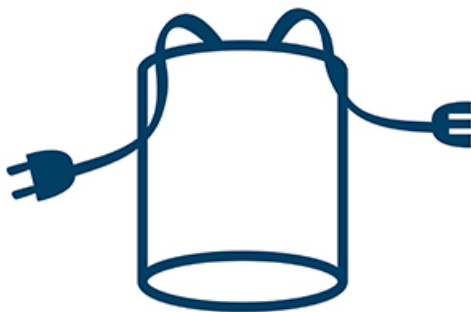
30" power cord with male plug, 30" power cord with female connector