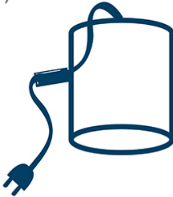
10' power cord with rollswitch & male plug